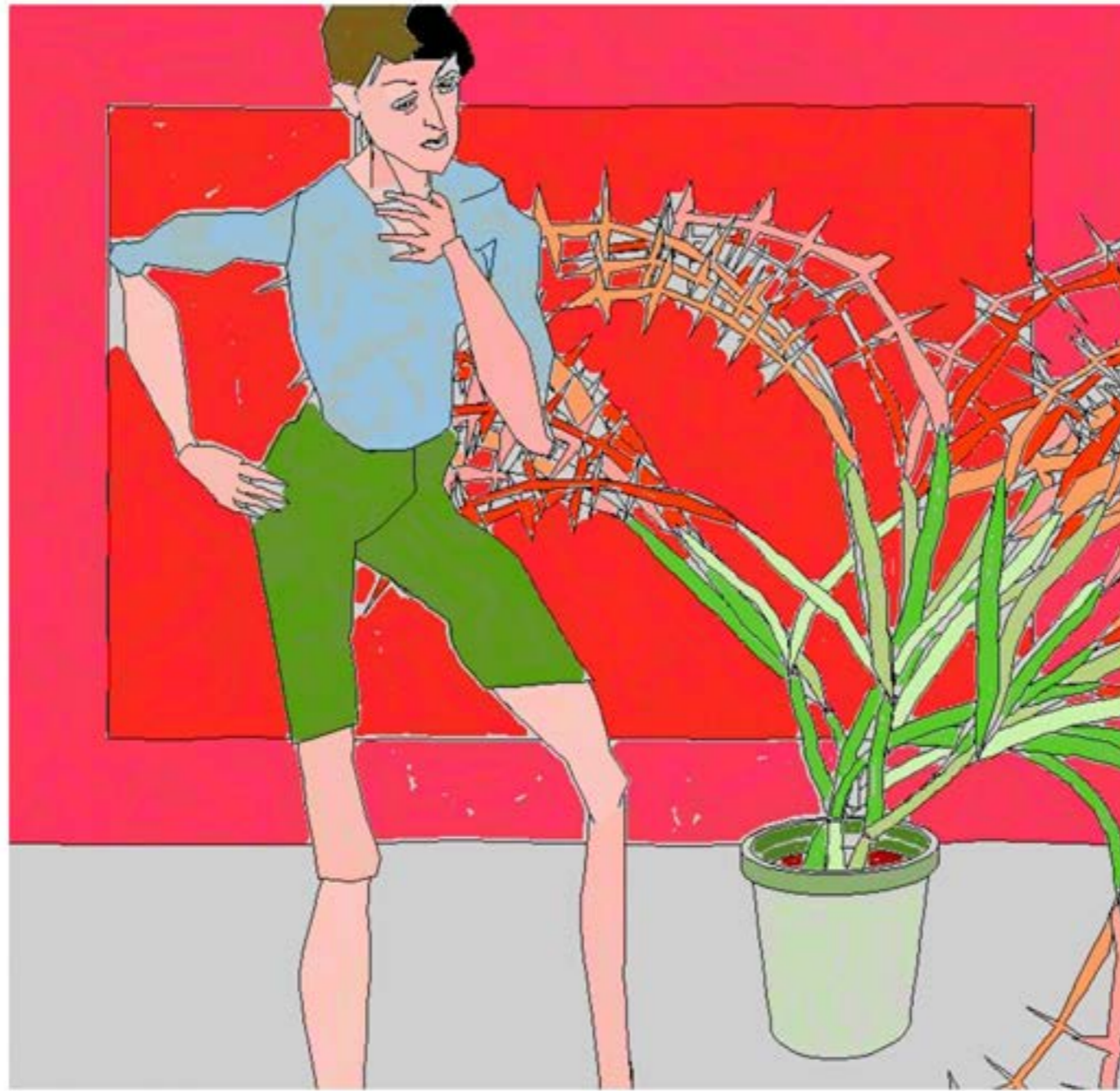
HAROLD COHEN: AARON FEB 3–JUNE 2024