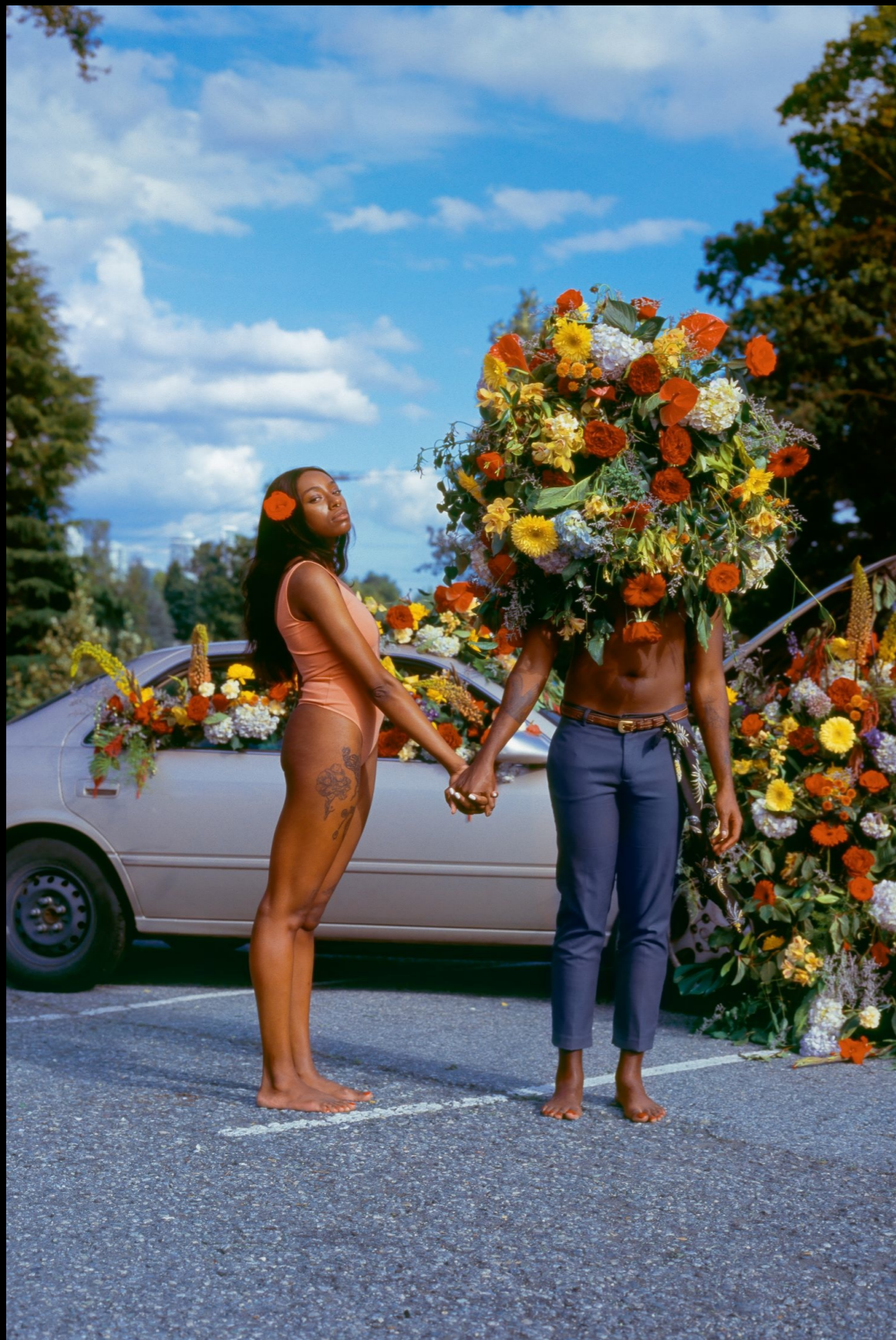
Kriss Munsya, Highway Reflection , 2020