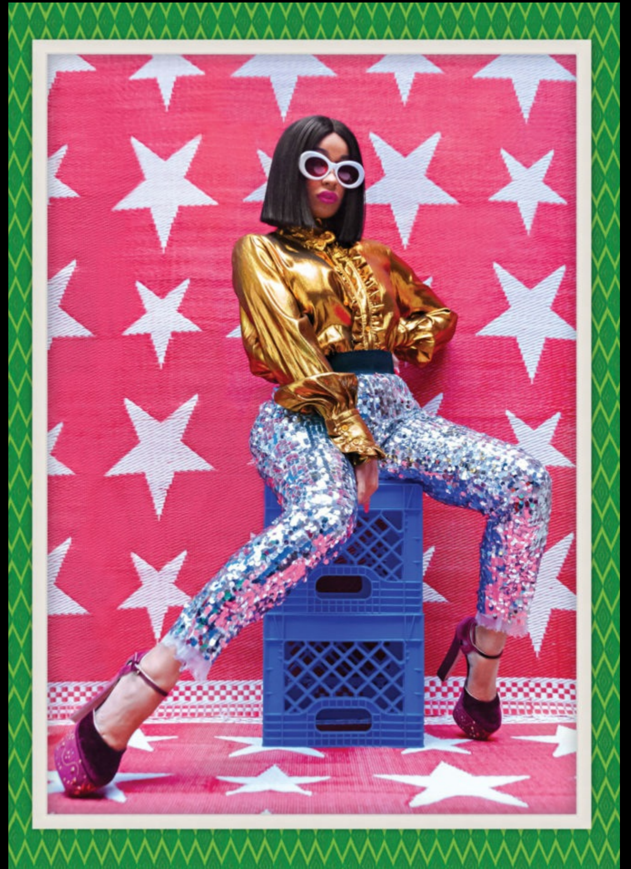
Hassan Hajjaj, Cardi B , 2017